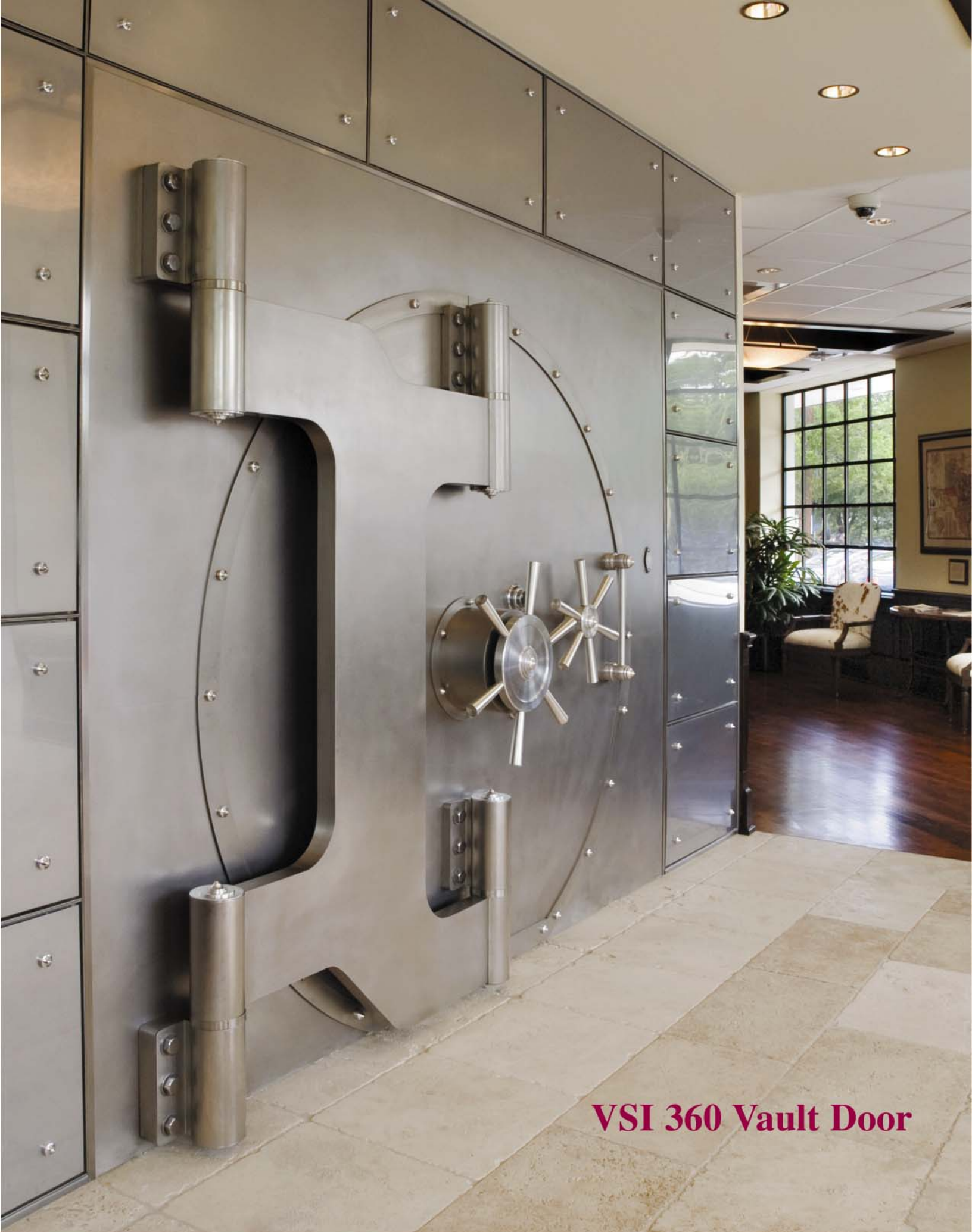
VSI 360 Vault Door