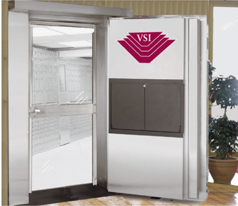
Door shown with optional custom logo