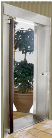
Solid Acrylic Daygate