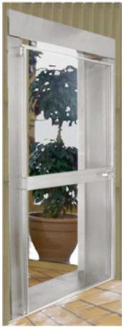
Standard Style Daygate