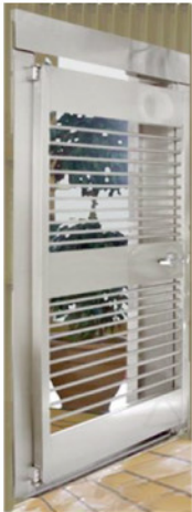
Rod Style Daygate